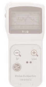
Infrared Communication Type

CO2: 0 to 9,999 ppm Temperature: -30 to 80 °C Humidity: 0 to 99 %RH High Precision Temperature/Humidity Sensor ( HHA-3151 ) Included