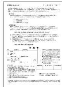
Guide book written guarantee